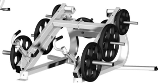
DEAD LIFT / SHRUG