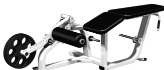
LEG CURL PRONE