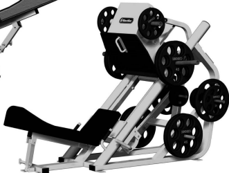
INCLINE LEG PRESS